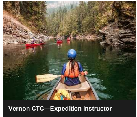
Vernon CTC—Expedition Instructor